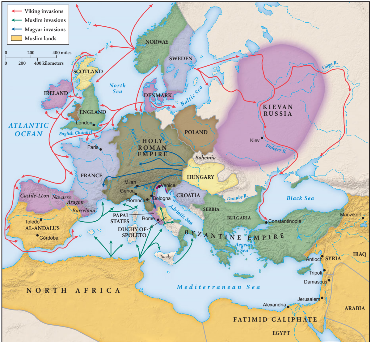
Map 10.3 Europe in the High Middle Ages

By the eleventh century, the national monarchies—of France, Spain, England, Poland, and Germany—that would organize European political life had begun to take shape. The earlier external attacks on Europe from Vikings, Magyars, and Muslims had largely ceased, although it was clear that European civilization was developing in the shadow of the Islamic world.