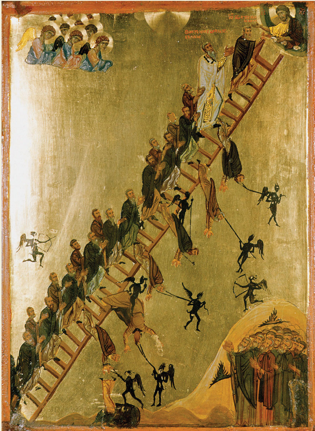
Visual Source 10.3 Ladder of Divine Ascent