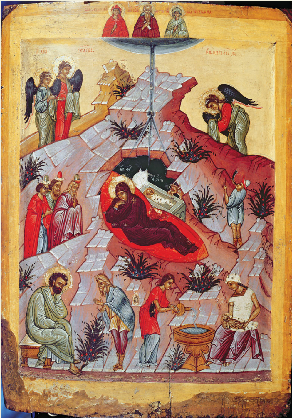
Visual Source 10.2 The Nativity (Private Collection/The Bridgeman Art Library)