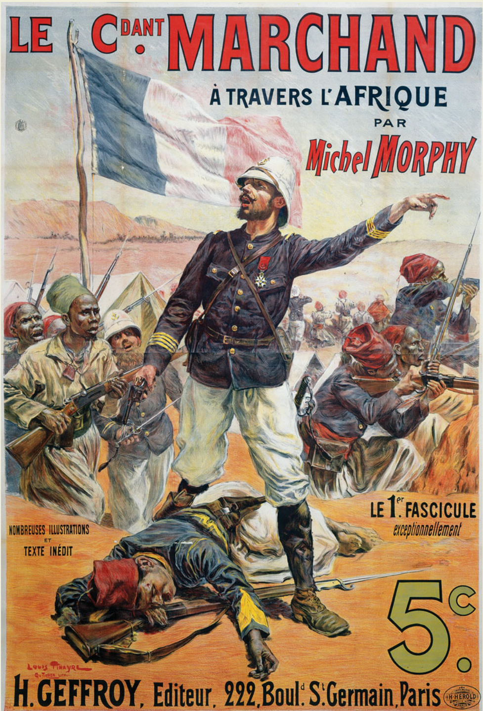
Visual Source 20.2 Conquest and Competition