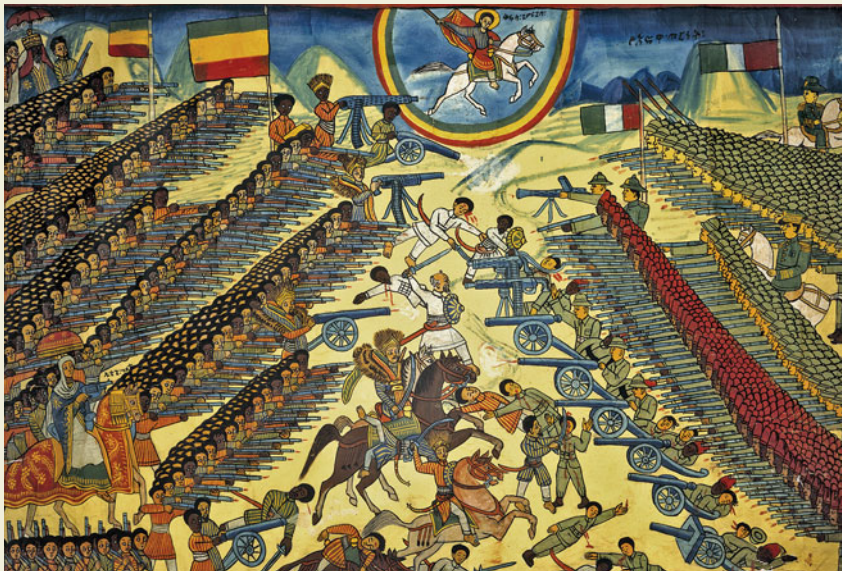
Visual Source 20.5 The Ethiopian Exception

One exception to the general European takeover of Africa during the scramble was the kingdom of Ethiopia. Located in the mountainous highlands of northeastern Africa, Ethiopia boasted an ancient pedigree, a long-established Christian culture, a literate elite, and rich agricultural resources. During the scramble for Africa, that country also had an astute monarch in Menelik II (reigned 1889–1913). Playing various European powers against one another, he acquired from them a considerable arsenal of modern weapons and gained substantial territory for his kingdom, in effect taking part in the scramble. In the famous Battle of Adowa in 1896, Menelik's forces decisively defeated the Italians, who were seeking to add Ethiopia to their country's African empire. By this victory, Ethiopia preserved its independence and became