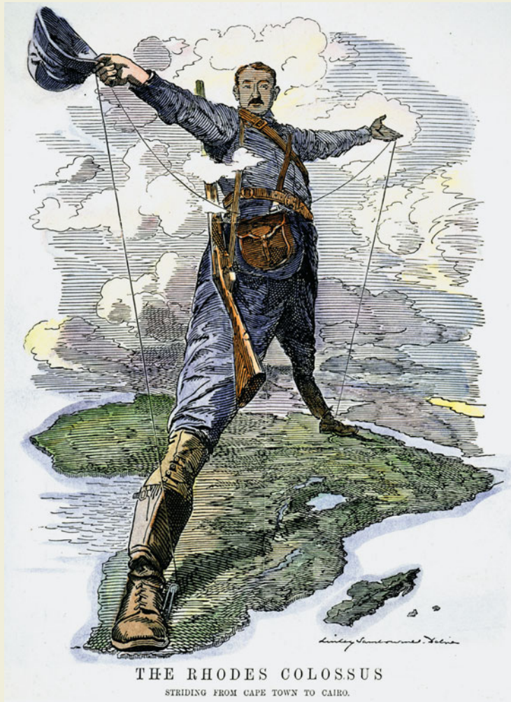
Visual Source 20.3 From the Cape to Cairo