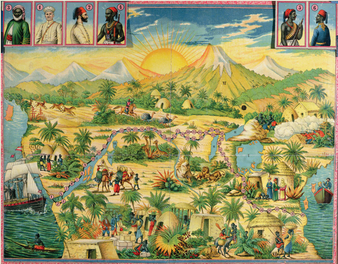
Visual Source 20.1 Prelude to the Scramble