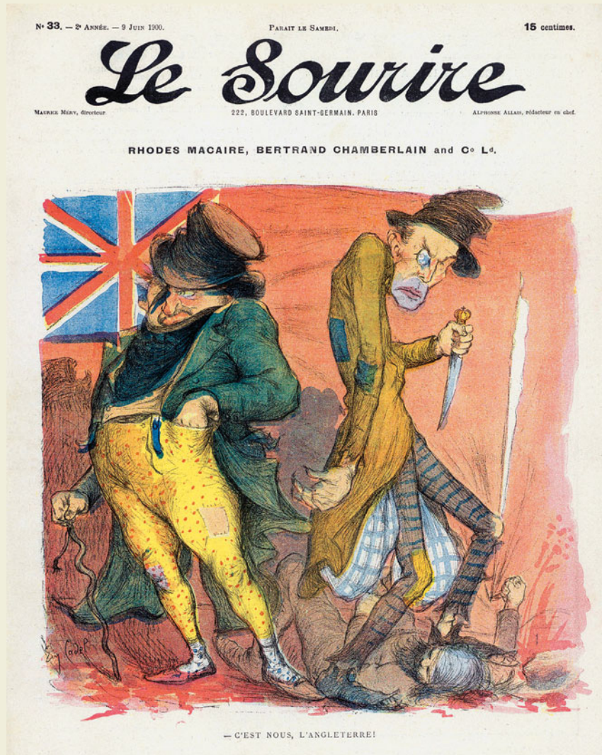
Visual Source 20.4 A French Critique of the Boer War

serious threat of growing German power in Europe. Visual Source 20.4, published in 1900, represents a critical French commentary on British imperialism during the Boer War. In that conflict, which began in 1899, British colonial authorities in South Africa sought to crush communities of earlier Dutch settlers, known as Boers, who stood in the way of complete British control over South Africa's rich diamond and gold resources. The figure on the left represents Cecil Rhodes, the arch-imperialist business magnate and a prominent politician in South Africa, while the figure on the right portrays Joseph Chamberlain, the British colonial secretary who ardently supported the war as a means of