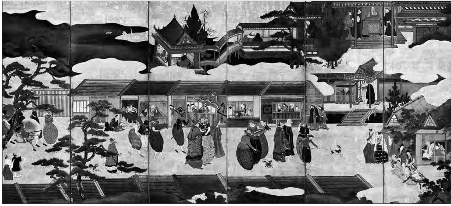
Southern Barbarians in Japan. Pair of six-panel folding screens; ink, color, and gold on paper. First half of the seventeenth century, Japan.

supposedly would enable the armies of his dutiful daimyō to overrun China. As is so often the case when politicians launch military invasions, the mix of private and public reasons for Hideyoshi's venture continues to perplex thoughtful observers. However, he declared that his goal was